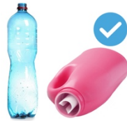
Plastic Containers, Bottles & Jugs